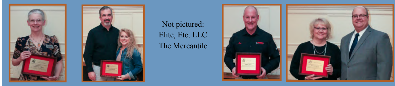
Not pictured: Elite, Etc. LLC The Mercantile